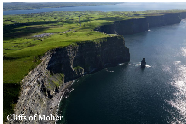
Cliffs of Moher