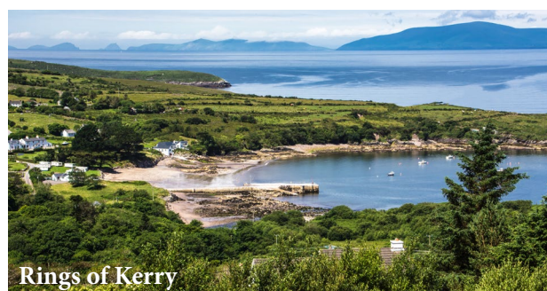
Rings of Kerry