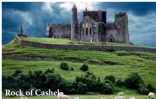
Rock of Cashel